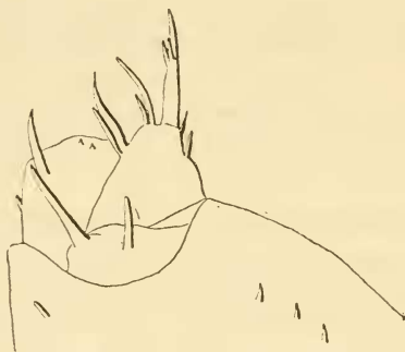
Fig. 5. Periscyphis brunneus 185/1 . [maxilliped. apex].

Margo posterior segment. 4. 5. 6. medio incurvo, angulis posticis acutis.